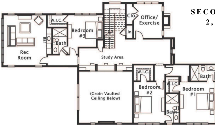
SECOND LEVEL 2,126 HSF

UNDER CONSTRUCTION ON LOT 4 5 BEDROOMS | 5.2 BATHS • 6,437 HSF